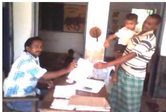
Figure: Mainstreaming of children in school