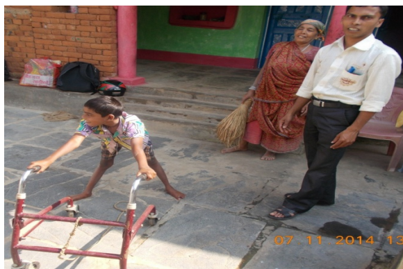
Figure: Provided assistive device to CP child

This project was intervened to meet the needs of the special children of 0-25 years of age of Chhura Block to provide social inclusion and rehabilitation, where the children were provided with the assistive device as per their needs. Social Welfare Department of Gariyaband district and Sarva Siksah Abhiyan (SSA) jointly provided with some assistive device in which the VI