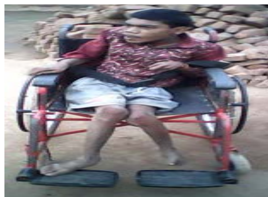
Figure: Provided assistive device to needy

type disabled children were given Braille book and a total of 06 VI children were able to go to school to and fro independently. Now, VI children are able to study with the help of Braille book. These children were able to travel around outside independently. The Cerebral Palsy (CP) children who were home bound earlier, are now travelling around with the help of Tricycle and Wheelchair.