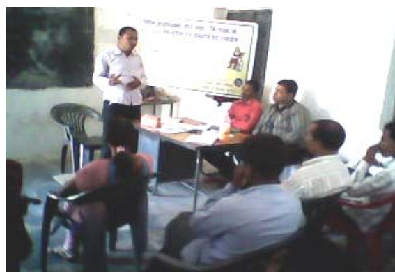
Figure: Training of regular school teacher

In project area Chhura block, we organized one day training program for regular teachers. In this training, brought awareness towards disability areas and discussed education & training activity techniques for children with special need. We provided detail information of disabled children to teachers. In zone level training program, there were presence of Source coordinators of Zone, teachers and head masters. In training, we discussed various things about disability such as; definition of disability, types of disability, how to recognize different