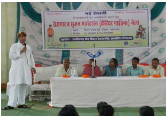
Figure: Speech of President ( PRERAK) in career guidance fair

PRERAK Organization organized Career guidance fair of intervention for social inclusion and rehabilitation of the children with Special need in Chhura block Gariabandh District, Chhattisgarh on 28 th October for disabled children. We celebrate the career guidance fair with disabled children and their parents in Mangal Bhawan in Chhura. Total 250 disabled people participated in this fair.