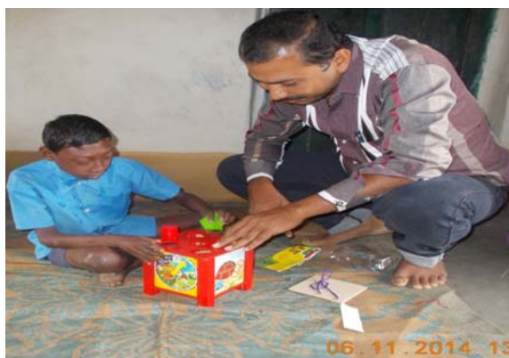
Figure: MR child is learning shape recognition

We taught MR children to respect persons in society and behave good manner after going other person homes. In orientation & mobility training, we taught skill of external and internal movement in home and talking manner with unknown person. We also taught MR children to friendly behavior with school classmates and teachers. We encouraged them for reading and writing habits. In this way, Now MR disabled