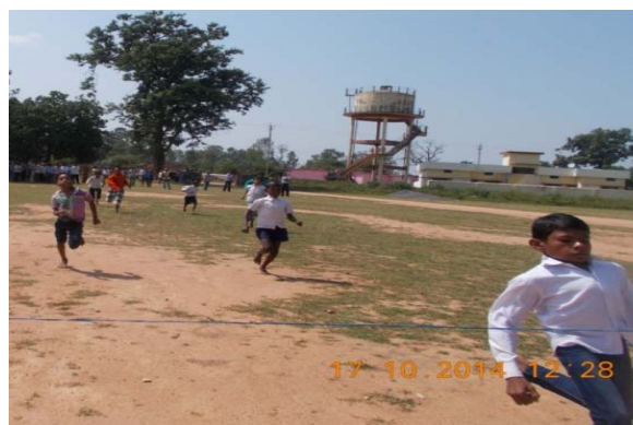
Figure: Running competition