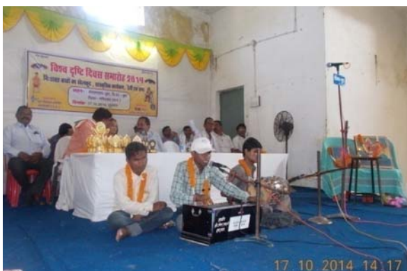
Figure: Cultural activities

This project was intervened for the need to rehabilitation and social inclusion of special children in the Chhura Block regarding a program on World Sight Day which was organized at the Community Hall at Chhura. In this program the disabled people from the entire cluster were present along with the members of the Parent’s Federation. The parents of the disabled children were also present.