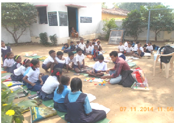
Figure: Individual education development in school

In project area of Chhura block, Children of age groups 3-6 years and 6-14 years took admission in Aaganbadi & school simultaneously. Those children, who have already admitted in Aaganbadi & school, provided basic education and playing activities. Disabled children took time to inclusion in Aaganbadi and school. After some time, all disabled children got involved in Aaganbadi and school with teachers and classmates.