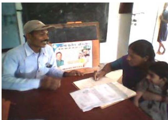
Figure: Mainstreaming of children in school

In Sarv Shiksha Abhiyan (SSA), having slogan of ' Sab Pade, Sab Bade ' (all read,all grow). But disabled children are not admitting in school. Head master and other teacher treat abnormal response towards those children during admission period, that, these children will read in special school only, here not. Because of this, parents don't admit their disabled children in school.