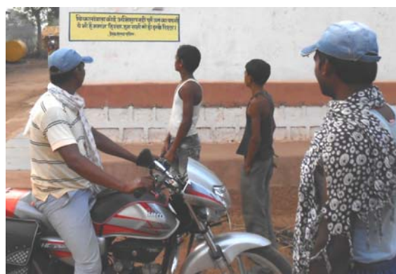
Figure: Wall writing in street villages

This project was intervened for the need to rehabilitation and social inclusion of special children in the Chhura Block, where a total of 144 slogans were written in 60 villages of five Clusters. The wall writings were based on spreading awareness among family, society and community regarding disability. These slogans were written by painters with paint in a 4" long and 1" wide canvas. These wall writings were done on the walls of the main crossings, streets, so that more and more people got aware regarding disability."Disability is not a taboo "- this awareness was mainly spread by this wall writing. In this wall writing program, awareness regarding the cause of disability, its medication and therapy etc were shown. So that the negative thought about disability can be changed.