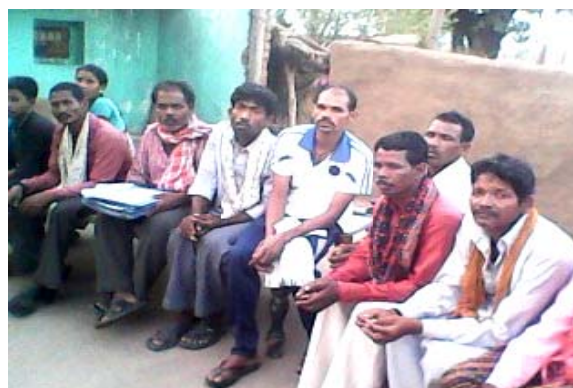
Figure: Formation of parent federation

Under project area of Chhura block constituted 83 parent federations in all 5 clusters i.e.; Panduka, Khadma, Kansinghi, Chhura and Mudagaon. In which, there were total 978 parents participated including 393 female and 585 male. After constituted parent federations in cluster level, then we constituted parent federations in block level also, where all parents were present. The objective of formation of parent's federation