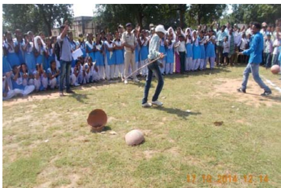
Figure: Busting of earthen pot competition