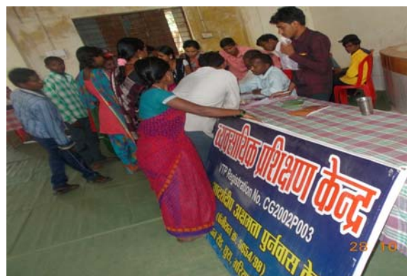
Figure: VTP counseling

These VTPs provided training in different trades as like; Dona pattal formation, Tailoring, beauty parlor, computer training, Cycle repairing, electrical, Mushroom production and Wood furniture trainings.