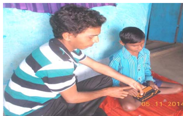
Figure: VI child is Learning mathematical calculation by using Taylor frame