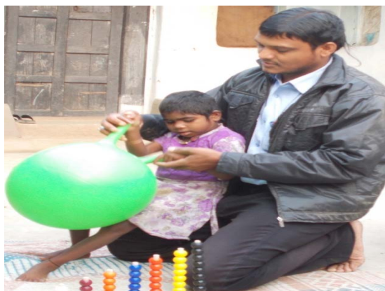
Figure: Counting knowledge and exercising by TLM

This project was for intervening to meet the needs of the special children of Chhura Block to provide social inclusion and rehabilitation to disabled children, where they were educated through TLM. These special children with MR, CP, VI, and Dumb & Deafness were procured with TLM aid. A total of 50 children were given the teaching aid. To develop Fine motor and Gross motor skills in C.P children TLM aid were given, likewise the mentally challenged children were given TLM for mind development i.e. Color recognition,