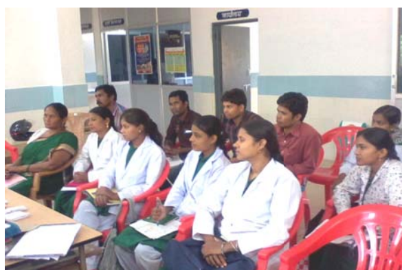
Figure: ANM Training program

In project area of Chhura block, we organized total 2 ASHA training program in semi health center and primary health centre with Doctors, ANMs and staffs. In this training, total 20 ANMs and 16 Doctors were participated.