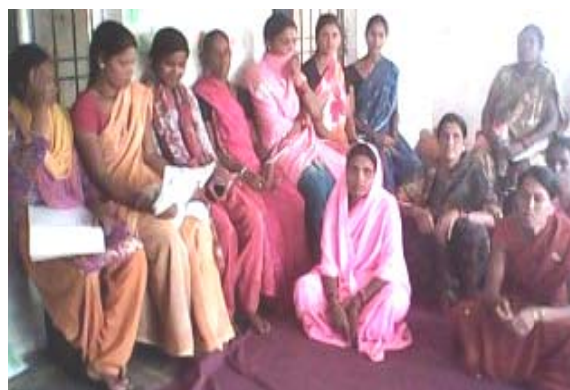
Figure: Mitandin training program

In project area of Chhura block, we organized one day training program for Mitandin. Mitandin having special role in village; they keep care of small children and pregnant women. They keep in regular touch with pregnant women from the period of pregnancy to post delivery. They are still in touch with those families after delivery of pregnant women. We provided training for Mitandin in different topics, such