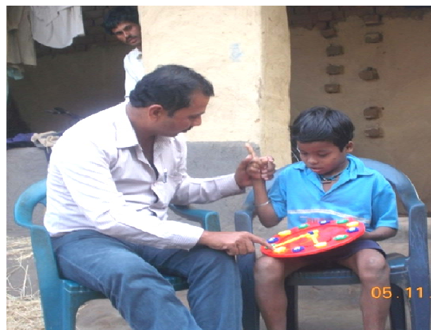
Figure: HI child is learning number by using abacus

Trained inclusion education facilitators provided plus curriculum, teaching guidance to VI, HI and MR through. VI type disabled children educated by Braille language, Taylor frame, abacus, cane technique; HI type disabled children educated by symbolic language. MR type disabled children educated by daily living skill, social inclusion and education activities. VI and HI type disabled children also educated by daily living skill, social inclusion, orientation & mobility and sensory skill as per need.