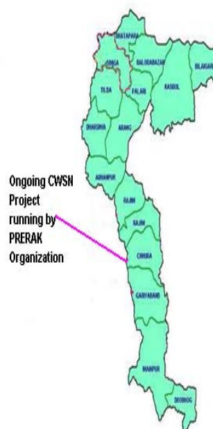
Figure: Project District

Our project area comes in Gariaband district. Gariaband district is situated in the east of Chhattisgarh state. Its boundary touches Orissa state. There are 5 developmental blocks with total population of 575480. Majority of the