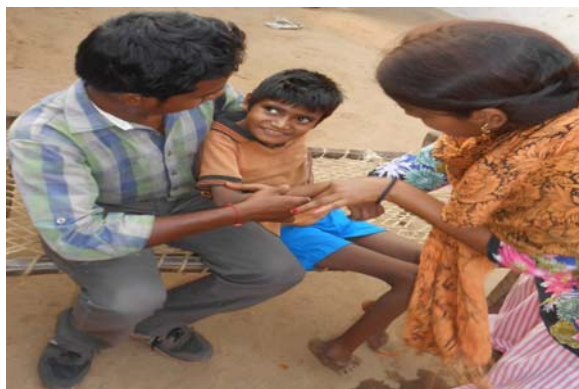
Figure: CP child is practicing exercise and movement

Daily Living Skill (DLS) & orientation and mobility (OM), health, education, rehabilitation related services come under intensive services . Severe CWSN identified in field area and started give intensive service by our trend care giver. Cerebral Palsy (CP), Mental Retired (MR), Hearing Impairment (HI) and Visual Impairment (VI) children of Chhura block benefited intensive services under running project intervention for social inclusion and rehabilitation of the children with special need. Total 88 children provided intensive services by Field staffs and I.E. Facilitators; in which 46 CP, 20 MR, 7 HI, 13 VI, 2 MI type disabled.