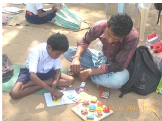
Figure: Individual education by TLM

Under development of individual education development plan, we have taught education technique to AWWs, Aaganbadi assistants in Aaganbadi and teachers and head masters in school for disabled children. In result, now teachers able to teach disabled children in well manner.