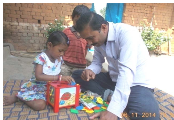
Figure: Mental development through TLM